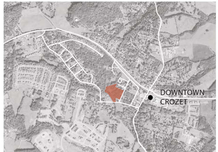
Crozet area with The Glen shown in red (Google Earth with annotations)

Over the past seven years Piedmont Housing Alliance has acquired several contiguous parcels, comprising approximately 10 acres, which are located predominantly along the north side of Powell's Creek near the intersection of Blue Ridge Avenue and Jarman's Gap Road. The site provides a unique opportunity to create a traditionally scaled extension of the existing village of Crozet within a short walk to Crozet's downtown shops and amenities.